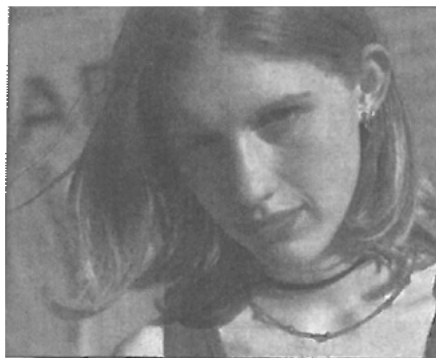
Homelessness can't be determined by appearance. For information on recognizing the warning signs of homelessness among students, visit www.serve.org/nche/nche_web/warning.php .